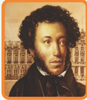
Birth anniversary of Alexander Sergeevich .