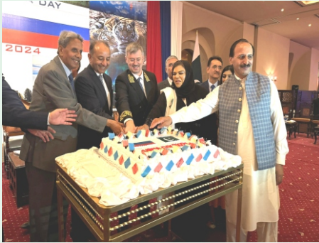
National Day of Russia