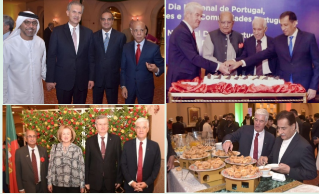
National Day of Portugal

Volume 14, • Issue No. 167, • Month: July, 2024