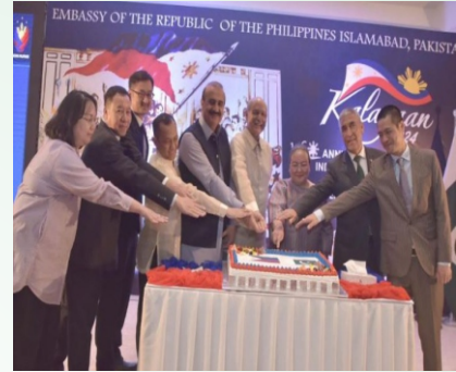
National Day of Phillipine