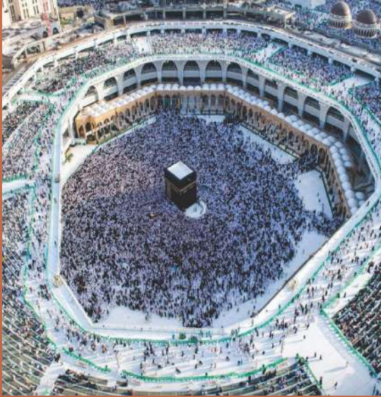
Saudi Government Requires Hajj Visa for Hajj Performance

A Premier Urdu & English Language Magazine for News and Diplomatic affairs in Pakistan.