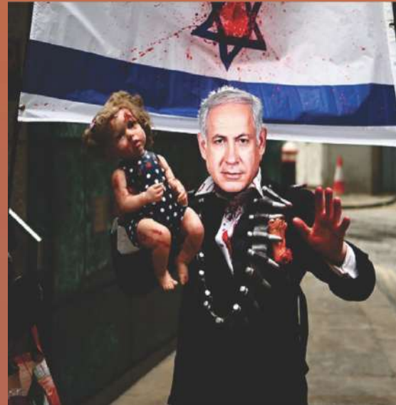
Israel's Preparations to Attack Rafah After Gaza