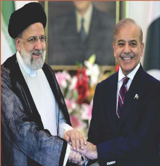
Iran President Visit to Pakistan