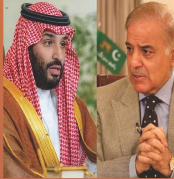
Shehbaz Sharif's visit to Saudi Arabia.